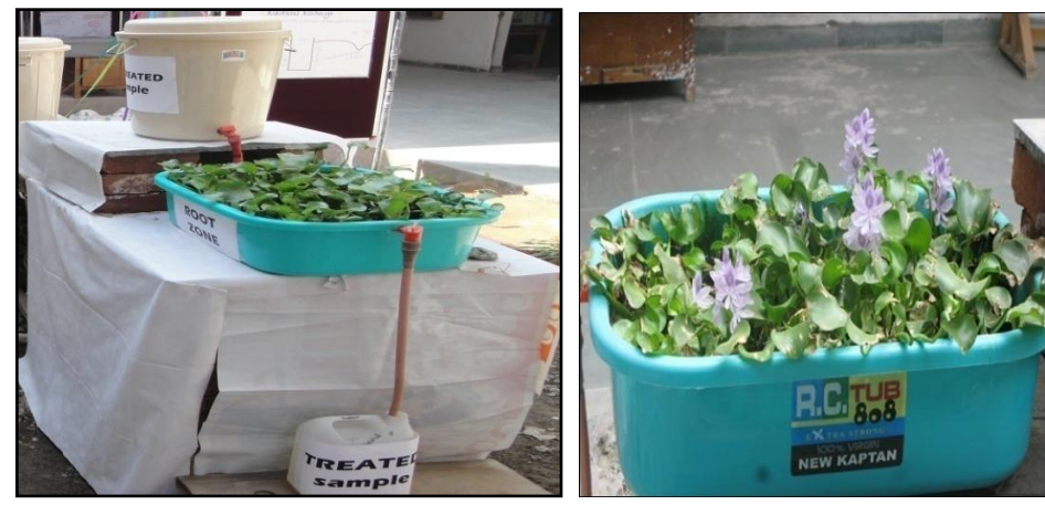
Figure 2 and 3: Constructed Wetland design and set up using E. crassipes

earlier the sewage samples were analyzed before and after treatment for various physic-chemical and biological parameters by using standard methods [20].