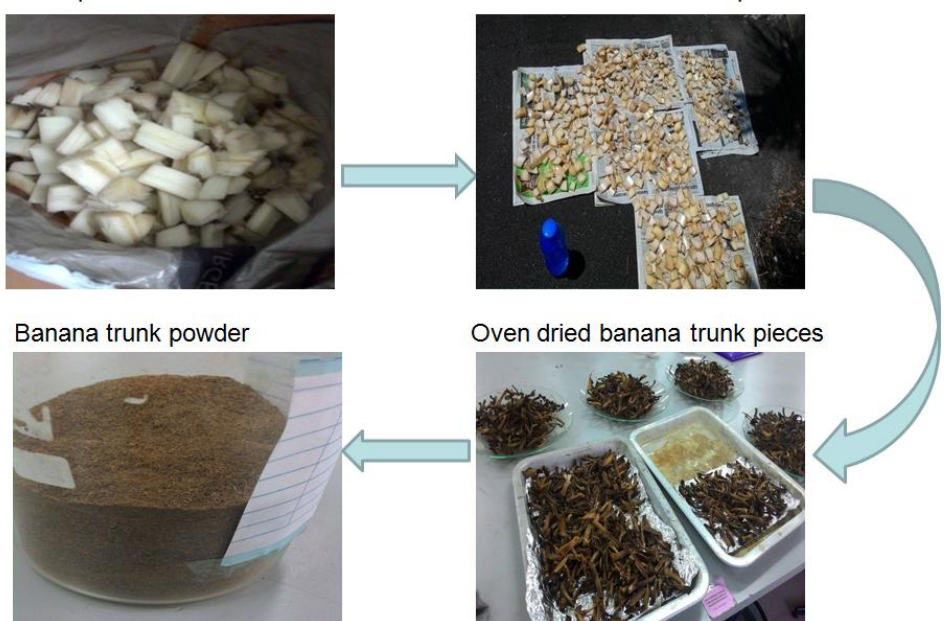
Fresh pieces of banana trunk