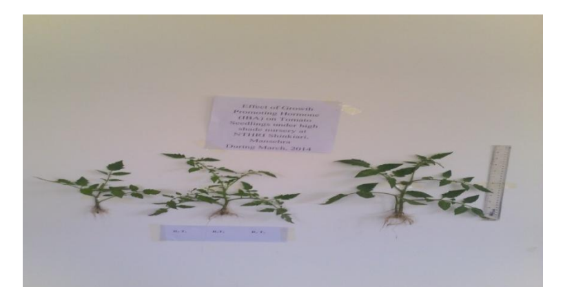
Figure 2: Different concentration of IBA showing root formation during study period.