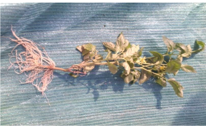
Figure 3: Single Tomato plant of Sahil Hybrid showing response for root formation.

Figure 2: Different concentration of IBA showing root formation during study period.