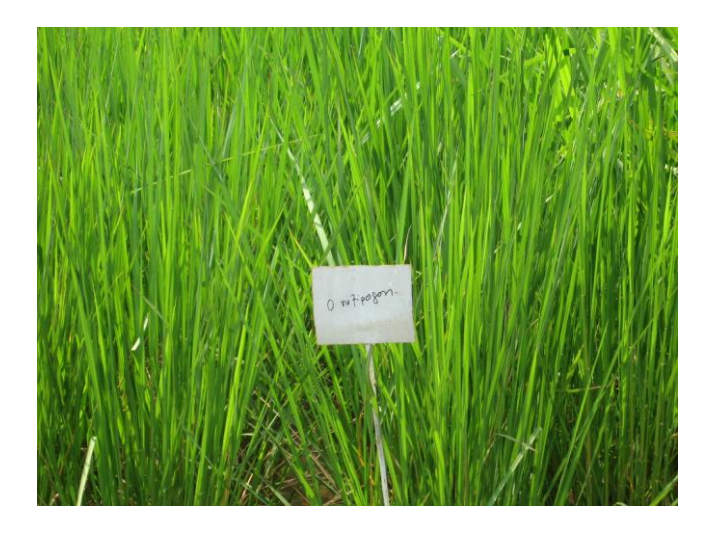
Figure 3: Oryza rufipogon in field at booting stage