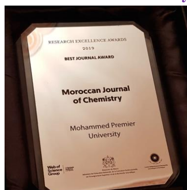
WOS-Clarivate Award – 2019 & 2021