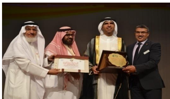
Arab Award in Chemistry-2013