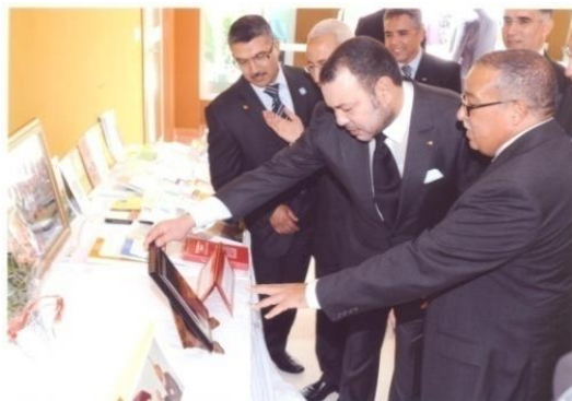
Historic Visit of His Majesty the King Mohammed VI to UMP, near Elsevier/Scopus Award, July 2, 2011