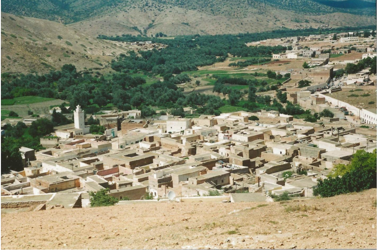
Global view of Debdou City