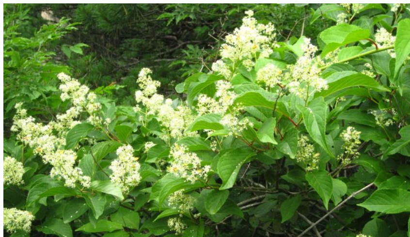
Figure 1. Celastrol isolated from the root extracts of Tripterygium wilfordii .

Celastrol is a natural product and has been widely used in traditional Chinese medicine. It contains a pentacyclic triterpenoid isolated from the root extracts of Tripterygium wilfordii (Figure 1) [1].